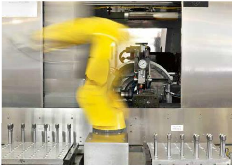
1 The increasing degree of automation and digitalization transform precision tool manufacturing into a proving ground for digital structures as the foundation of an Industry 4.0

To release the available rationalizing potential in the fields mentioned above, the rapidly increasing demand for information during process execution must be covered. The channeling or forwarding of information that emerges during process execution requires a cross-departmental synchronization of all relevant fields. Computer support in the product-defining departments is similarly important as production itself for manufacturers with a direct link to their customers and relatively small lot sizes. With regard process control according to Industry 4.0, there is a catalogue of important organizational pre-conditions that have to be available and controllable for SMEs for the successful realization of digital and decentralized control methods.