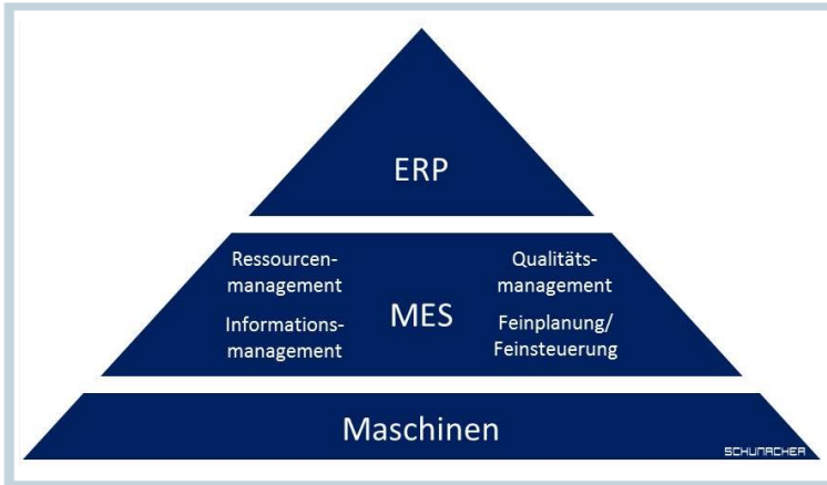
2 Basis for research on the Industry 4.0 capability of SMEs: the VDI 5600 guideline for networking in production companies (© Schumacher)